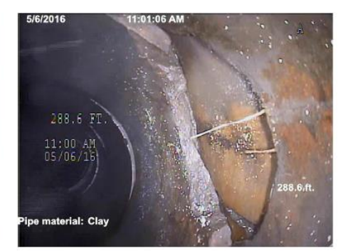
Page 2 of 3